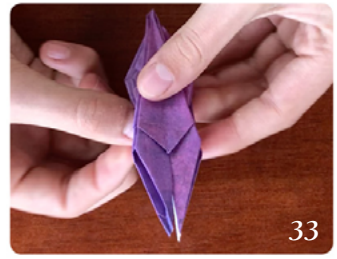
Flatten your model down well. Then, fold the two small side points in towards the middle like in figure 31-32. Turn your model over like in figure 33.