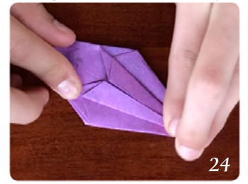
Repeat 23-24 same folds on the other 3 sides