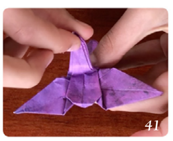
SHAPE DUMBO'S HEAD by folding the top point back like in figures 38-39. SHAPE DUMBO'S TRUNK by folding it up and down at two points as shown