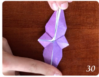
Make sure both sides of your model show 4 even folds, adjusting as needed. Fold your bottom tips up toward the top point to open up your model.