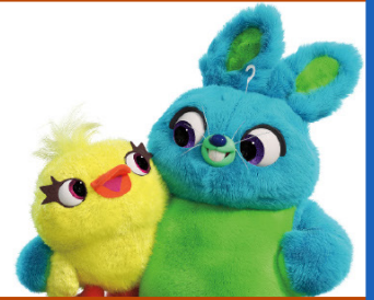
DUCKY & BUNNY